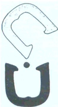
The top shoe, bottom shoe is not a ringer.