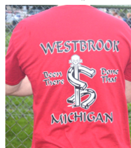
A good example of a tournament shirt.

All contestants competing in a World Tournament shall have, as a minimum, their last name and State or Country abbreviation professionally lettered on the back of their